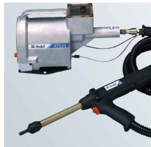
753 Standard tool