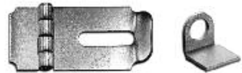
Plain Steel, Welding Hasps No. NHPS625 & NHPS825